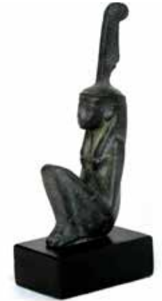
MAAT: The ancient Egyptian Goddess of Truth, Justice and Order with approximately 4,500 years of history.